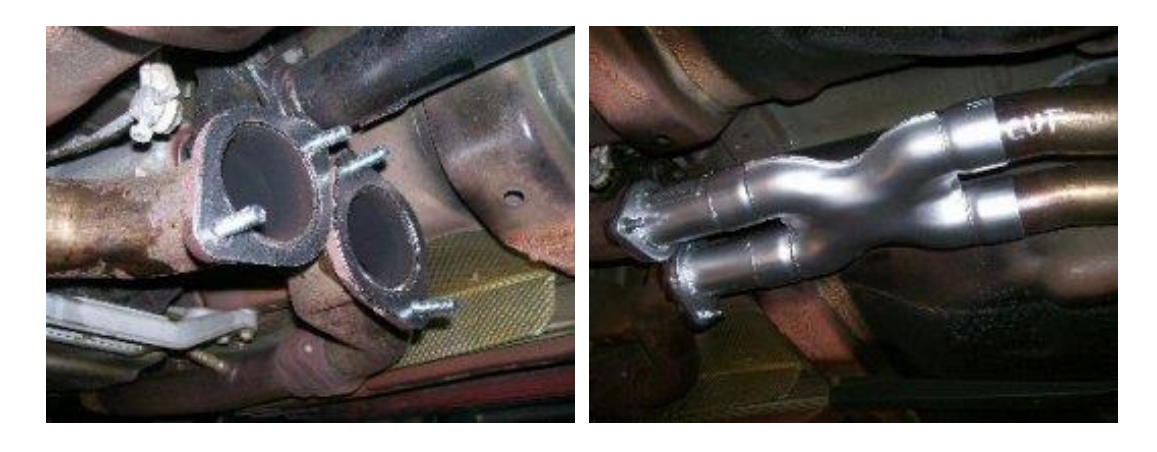
Figure 3 Figure 4

Put car on a lift or a set of drive up type ramps (it is not recommended to use jack stands because the car will be moving around during the install) Using a sawzall, cut the exhaust tubes directly behind the factory welds of the resonator (fig1)